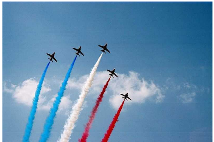
Castle Flying High At Farnborough Air Show