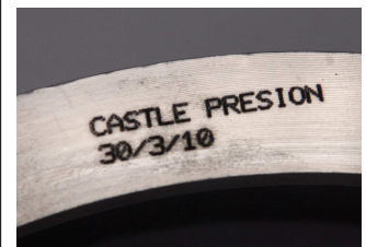
Test Piece Spelling kindly provided by Pryor

doors with the dot matrix capability also being applied to a part we currently have to subcontract. In future all Rolls-Royce finished parts will require 2D matrix style marking.