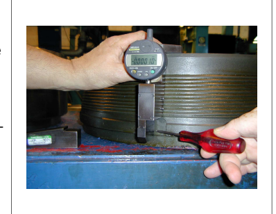
Slot measurement for Vetco

With regards to our major inspection equipment such as the Brown and Sharp CMM's, these are covered by annual contracts which cover all recalibration requirements so that all aspects of our QC process are covered.