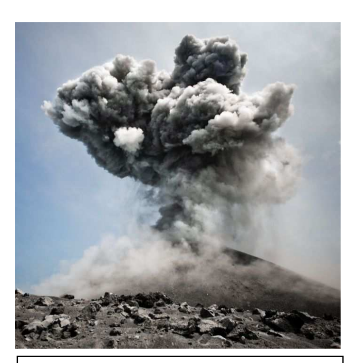
Say it with me... E-YAF-YALLA-JO-KULL...and I'm not going home any time soon.

As you will have probably already noticed, green, red, grey and yellow bins have been dispensed around the factory in sets of four. These are the new recycling bins.