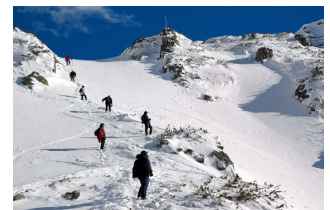
Our Intrepid Explorers

We would also like to commend the fantastic effort of all those who walked to work after one of the heaviest snow falls in living memory (Monday 6 th December 2010). Many walked hours in freezing conditions to show their commitment. Whilst others simply refused to miss curry day.